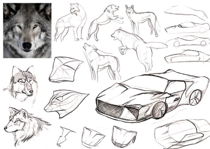
Figure 2. Car bionic design based on wolf form deduction

Design idea: As shown in Figure 1, in this case, the wolf was selected as the bionic object of the car, mainly based on the similar association of the dynamic characteristics and head characteristics of wolves. First of all, the designer first described wolves from different angles and poses, with emphasis on dynamic and head characteristics analyzing. On the one hand, the dynamic curve of the jumping posture of wolf is applied to the car body design; on the other hand, the front and side profile curves are extracted from the head shape of the Wolf and applied to the front face design of the car. In this way, the characteristics of "sporty" and "power" of wolf are integrated into the temperament of the car, adding the sense of potency and speed to the overall design of the car, presenting a strong visual effect and sense of wholeness.